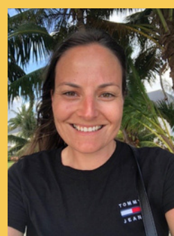
Cat Watts Release Kaiako