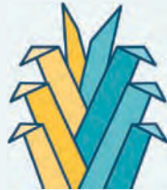
Harakeke: Year 3-6