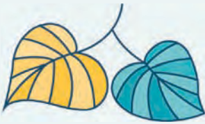
Kawakawa Year 0-2

Our learning environments are the places where your child will be learning. This learning place is both the physical classroom buildings as well as the natural physical environment. Our learning places are flexible and innovative and students will have opportunities to work across these spaces. Our learning environments are named after the native plants that Suzanne Aubert used in her rongoa (herbal remedies) as part of her healing ministry. The two learning environments being used in 2021 are: